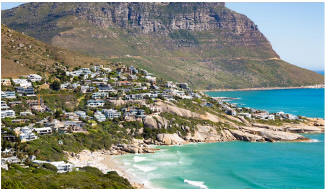
Cape Town, South Africa

Apart from these wonderful beaches, couples will love to explore the Victoria and Alfred Waterfront, Two Oceans Aquarium, and Camp's Bay glitzy beach and awesome shopping are other highlights around Cape Town.