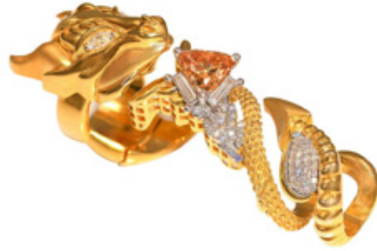
THE SEDUCED - Statement Red Carpet Ring

The lure of social media is but a fatal attraction and its tempting nature presents a false ideal. It captivates and ensnares, alluring