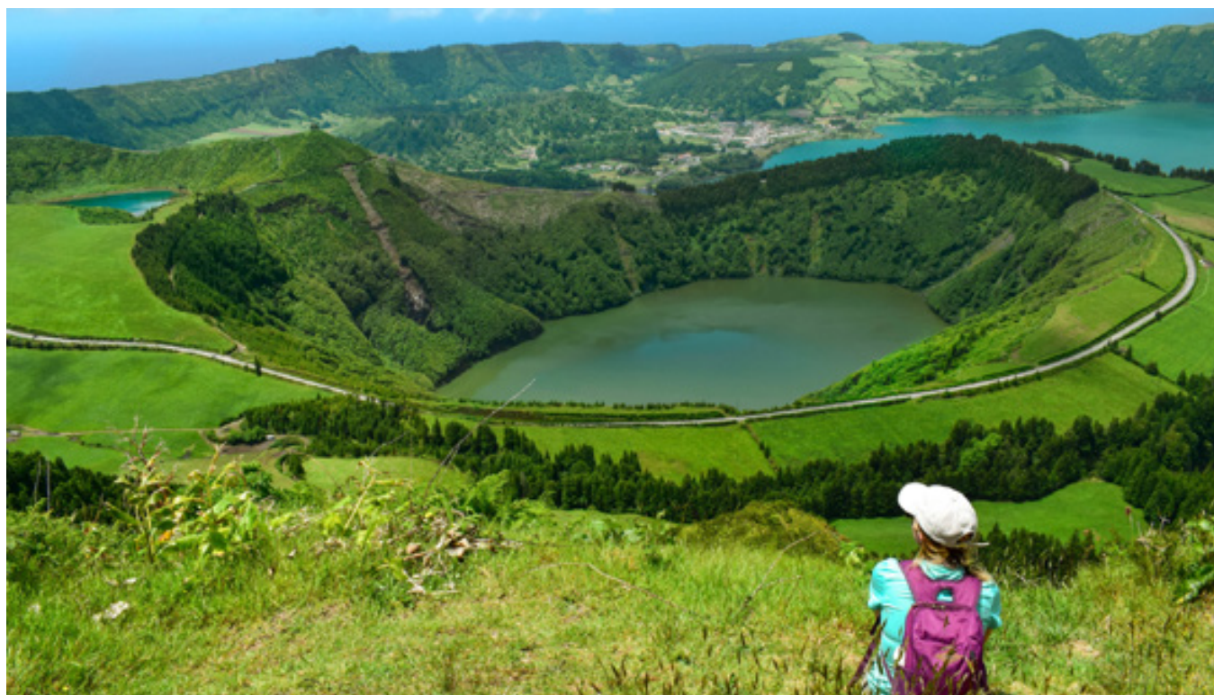
The Azores in Portugal

Each of these destinations echoes the global song of environmental responsibility. As the tapestry of eco-friendly travel trends continues to evolve, it's evident that the world is shifting from mere exploration to conscientious journeying. Green vacation spots across the globe serve as beacons, illustrating that beauty and sustainability can coexist in perfect harmony.