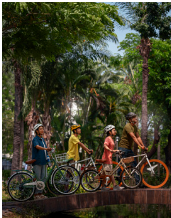
Eco Tourism, Cycling Outdoor

efficiency. On the tech front, Regenerative Braking Systems are being incorporated into many electric and hybrid cars. By harnessing energy typically lost during braking, these systems add a layer of efficiency.