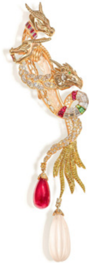
FIRE - Statement Cocktail Earrings