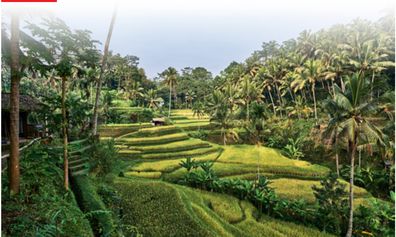
Our Green Planet

As the wheels of sustainable transportation tread softly on Earth, they pave the way for tourism that reveres rather than exhausts the world's wonders. Together, they form an alliance, ensuring our adventures tread lightly, even as our horizons expand. By prioritizing the environment and crafting travel experiences that are both enriching and sustainable, we are not just witnessing but actively participating in a transformative movement.