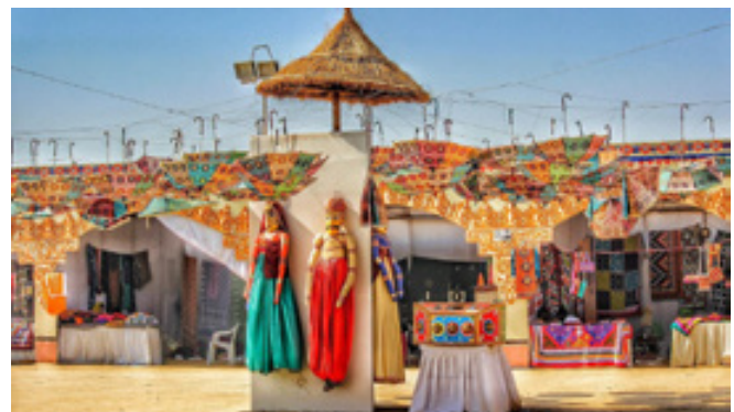
Rann Utsav, Kutch

homemade wine tastings, and meals prepared with fresh produce from the garden. Meanwhile, in Kyoto, Japan, local artisans open their workshops to share the intricate processes behind crafts like Kiyomizu pottery or Nishijin weaving.