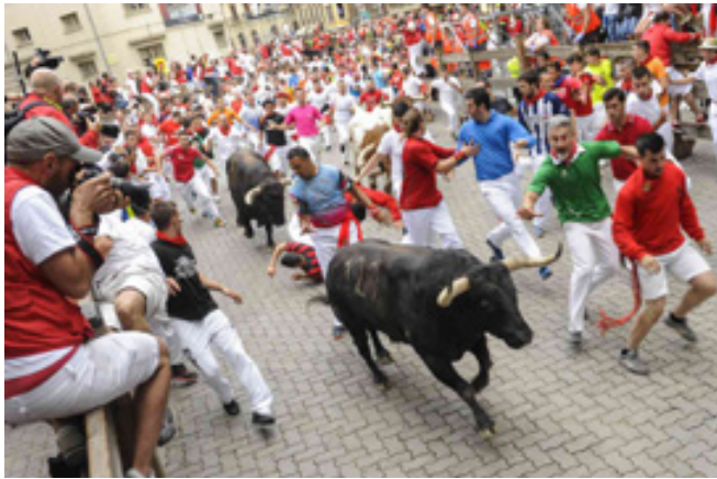
Pamplona Bull Run, Spain

lowered into the water and left to face ferocious crocodiles. Regular feeding by the crocodile handlers means the crocodiles are close and personal with swimmers in the ultimate underwater adventure.