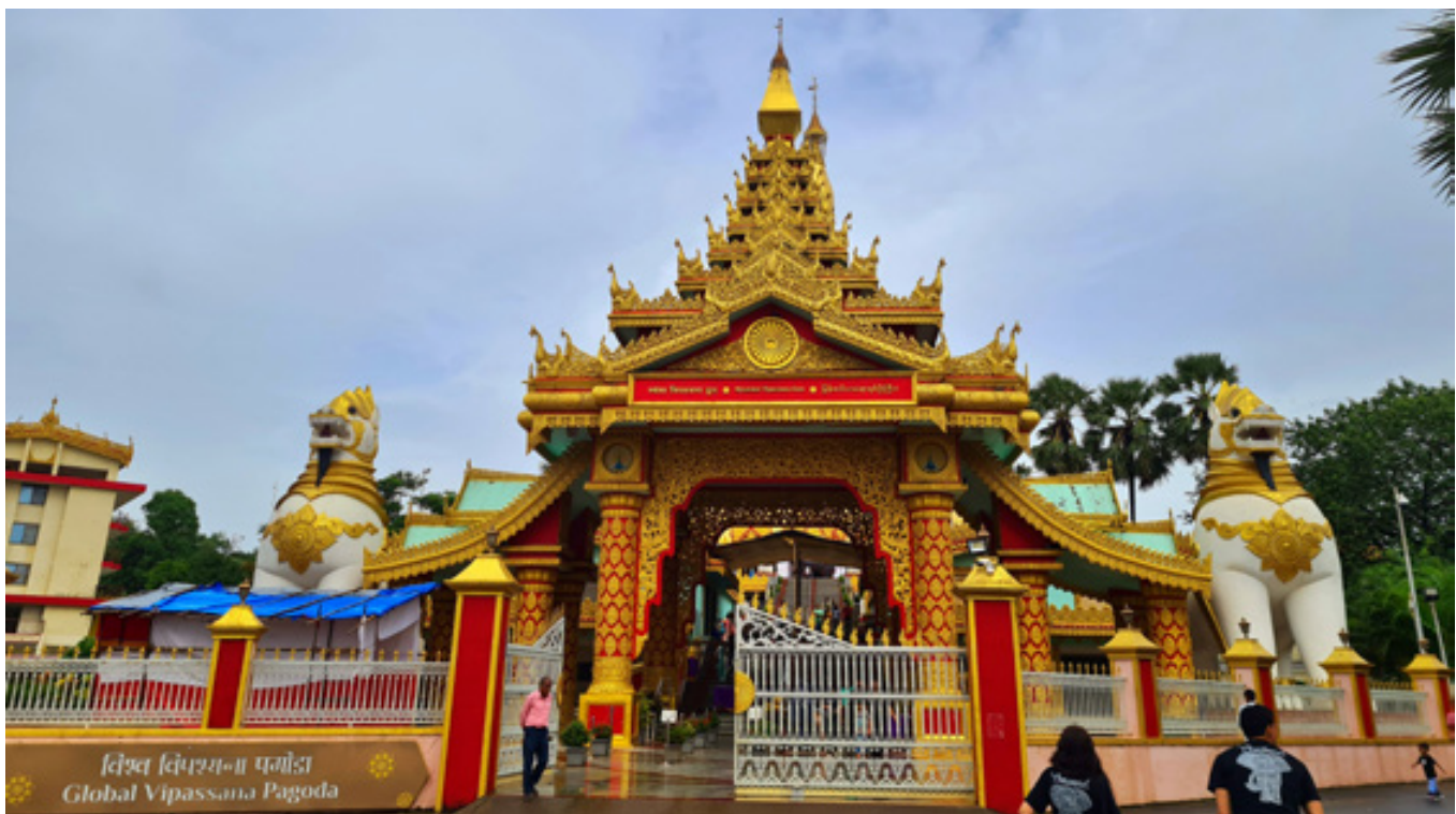
Global Vipassana Pagoda

So whether you're a curious traveller, a history enthusiast, or someone looking to explore Mumbai beyond the headlines, these lesser-known facts will offer you a unique and enriched perspective of this majestic city.