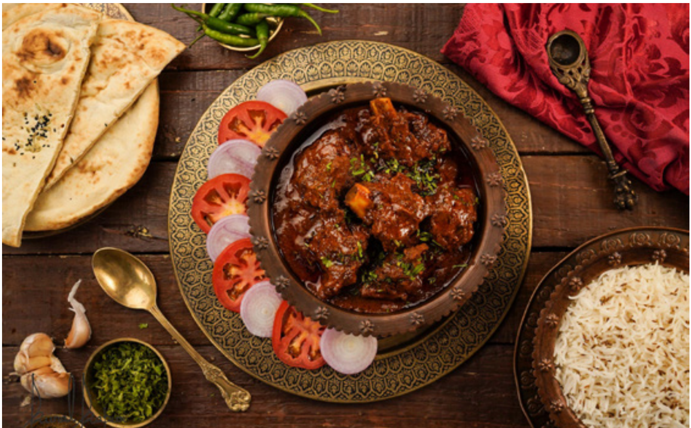
Kashmiri Rogan Josh