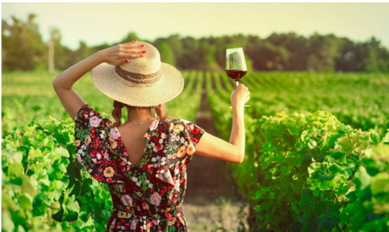
Luxe Wine Destinations

Here is a rich landscape of awesome countryside, a sea of vineyards, a background of rolling hills, where pinewood