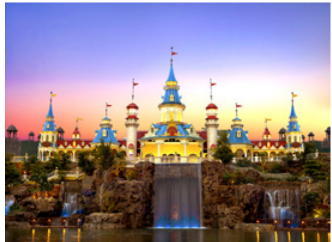
Imagicaa Entertainment Park

Mumbai's Global Vipassana Pagoda stands as an emblem of peace and harmony. Not only does this colossal structure captivate with its golden splendour, but it also holds the distinction of being the world's largest pillarless dome. Inspired by the Shwedagon Pagoda in Myanmar, it was primarily built to honour Gautama Buddha and his teachings. Tourists flock to this serene site to not only admire its architectural prowess but also to delve into the