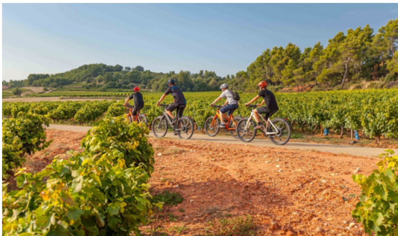
Cycling At La Coquillade

You can select from the most luxurious cruise ships like the Oberoi Zahra, a five-star Luxury Nile Cruiser, which