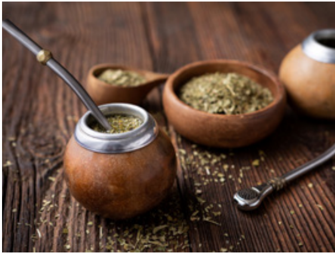
The Herbal Tea Yerba Mate

energetic. The peaceful Toda clan of these tea gardens helps in making this fragrant cup of tea. Nilgiri tea has a somewhat minty flavour, possibly because trees like the Blue Gum and Eucalyptus populate the locale.