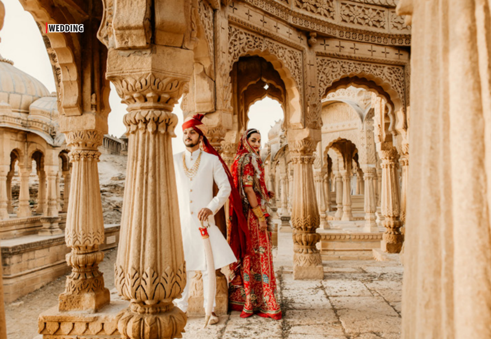
Traditional Rajasthani Wedding Couple