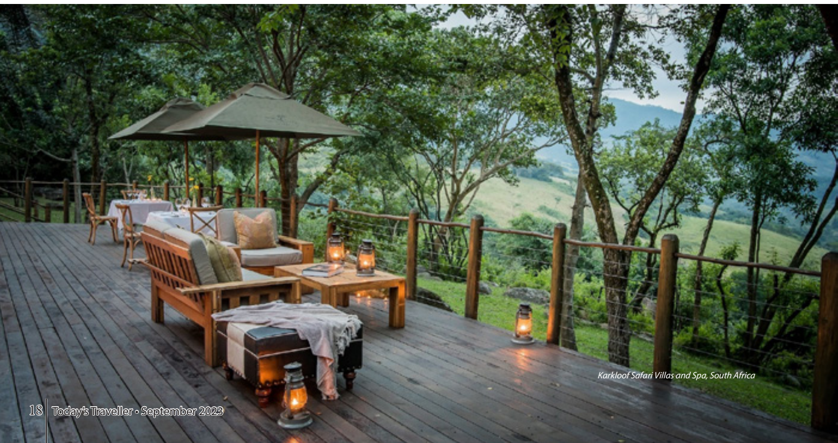
Karkloof Safari Villas and Spa, South Africa

Escape from stress and submit yourself to nature's bespoke offerings at the spa amidst luxurious African surroundings. Get yourself a pedicure even as zebras make short shrift of the nearby grasses or break the shackles of time and tension as soothing hands massage in the warmth of the African sun. You'll soon find out how every