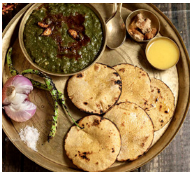
Makki Di Roti & Sarson Da Saag

No wonder, in the treasure trove of regional food specials, Aloo Potol Posto stands out for its unique combination of flavours and textures. This delectable Bengali delicacy pays homage to the fertile lands of West Bengal, where the humble pointed gourd, or “potol,” and potatoes, or “aloo,” find themselves transformed into a culinary masterpiece.