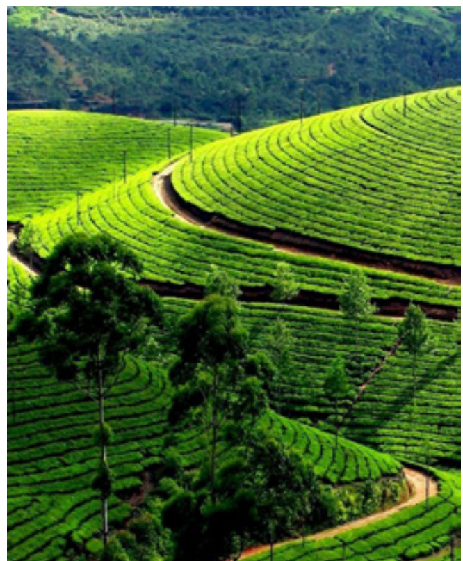
Nilgiris Tea Plantation, Tamil Nadu

Home to one of the best tea estates in India, Nilgiris Hills in Tamil Nadu is about a thousand years old. A scrumptiously fragrant tea, with sensitive botanical notes and brilliant yellow tones – this brew will make you feel freshly