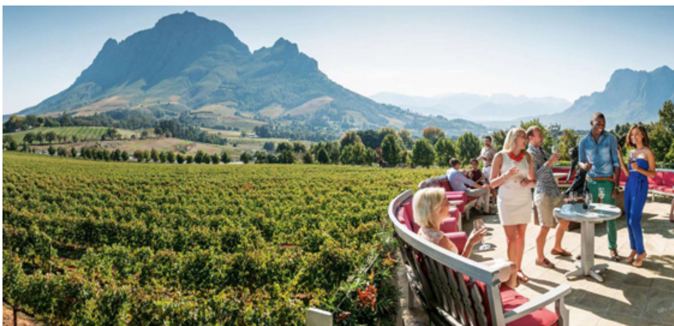
Cape Winelands, South Africa

The charming city of Porto offers visitors a great history, local and sophisticated shopping areas, and welcomes you