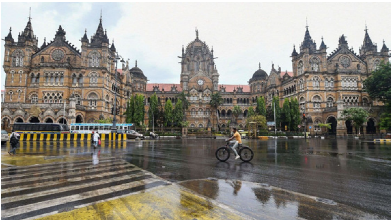
Chhatrapati Shivaji Terminus