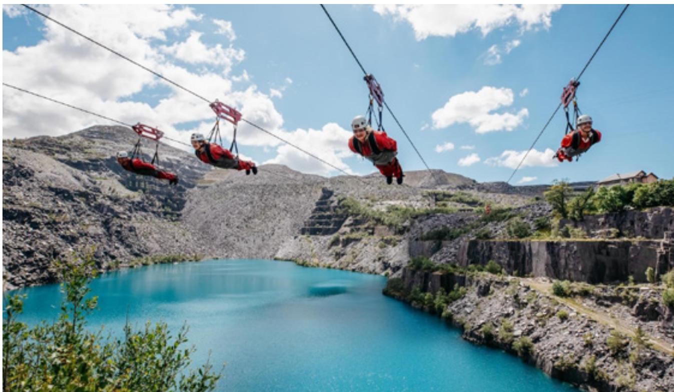
Zip World Velocity 2 zip wire, Snowdonia, Wales

G lobal adventure tourism is expected to grow to 2,257 billion pounds by 2030, with tourists swapping their poolside 'fly and flop' holidays for adrenaline-fuelled breaks. From boarding down active volcanoes to swimming with ferocious crocodiles, those with an appetite for adrenaline should try these terrifying activities to get their hearts pumping.