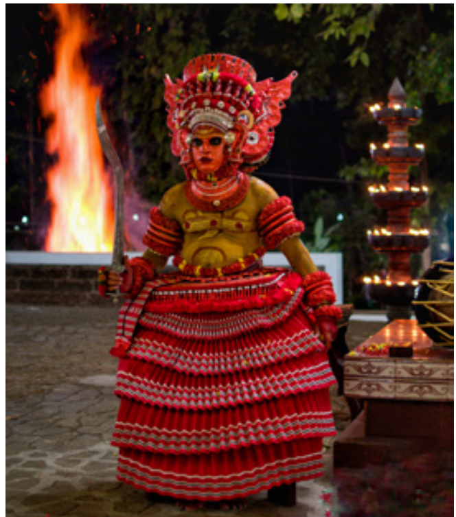
Theyyam - A Dance Form

Over the past few decades, there has been a resurgence of interest in Kalaripayattu. Schools have popped up across the world, and it's been incorporated into various fitness programs. Film and theatre artists have trained in Kalaripayattu for physically demanding roles, and it has