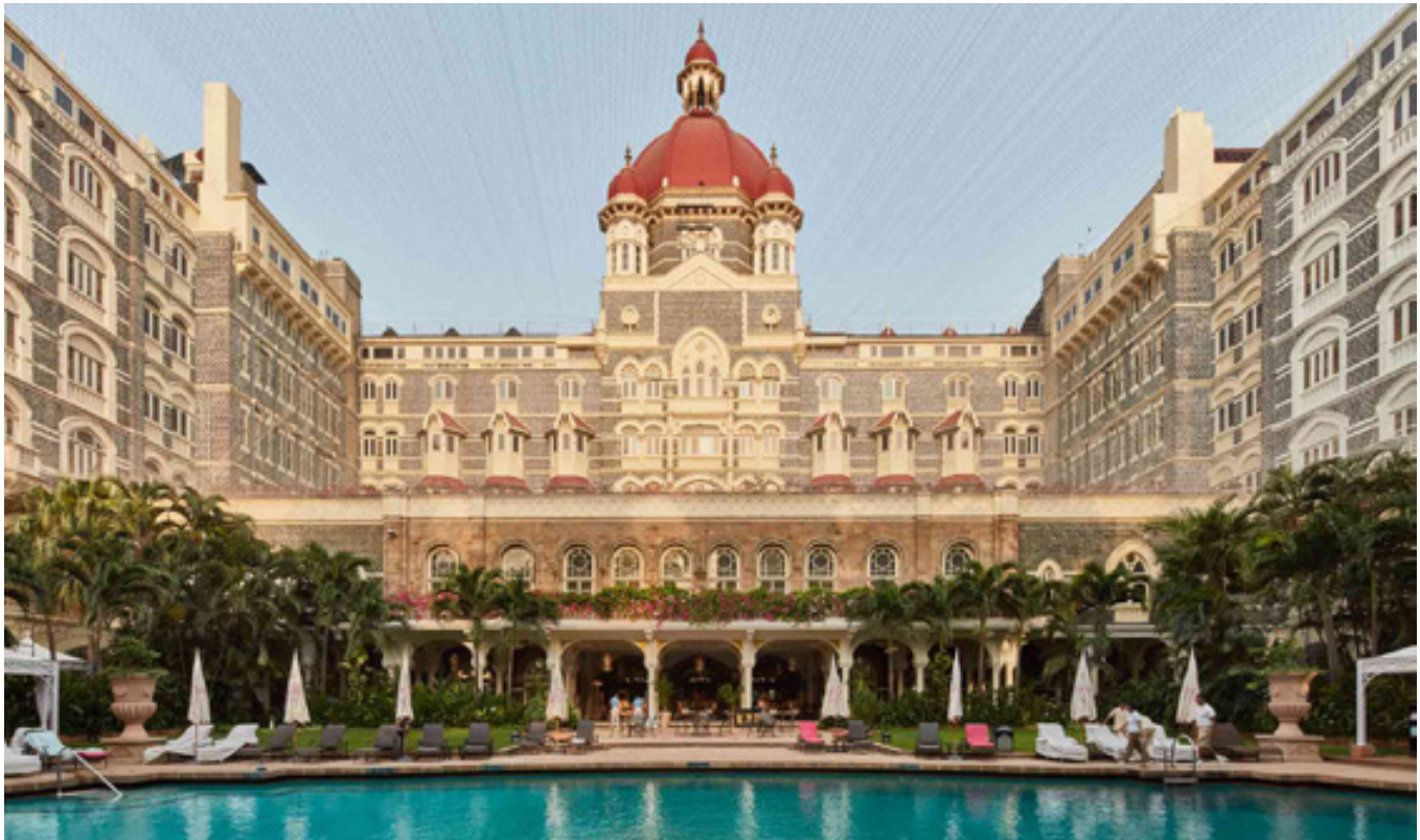
The Taj Mahal Hotel

As you gear up for your visit, let's dive deep into the heart of Mumbai and discover what makes it tick beyond its renowned landmarks.