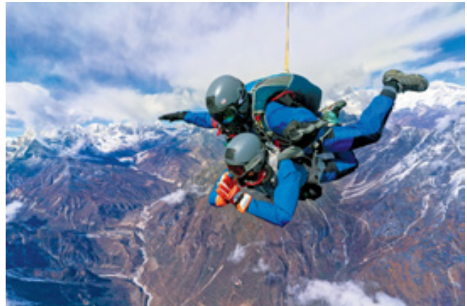
Skydiving Over Mount Everest, Nepal

White water rafting in the Eas Urchaidh waterfall on the River Orchy is not for the faint of heart, providing huge rapids,