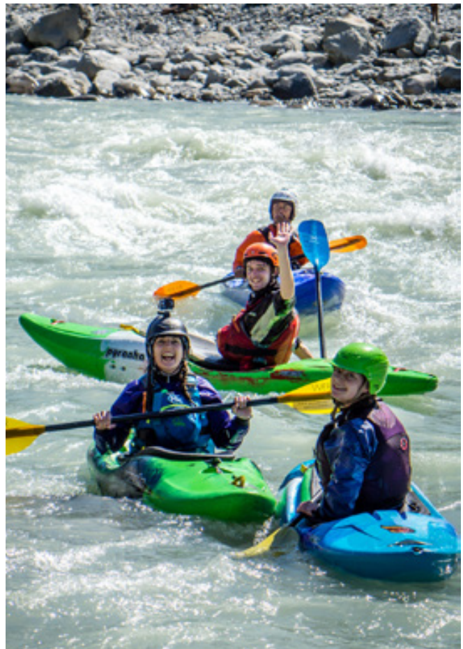
White Water Rafting, River Orchy, Scotland

narrow shots and waterfalls to satisfy the adventurous. Boasting some of the UK's most challenging and technical rapids, it has 6m high Falls, offering the ultimate high-octane experience for thrill seekers.