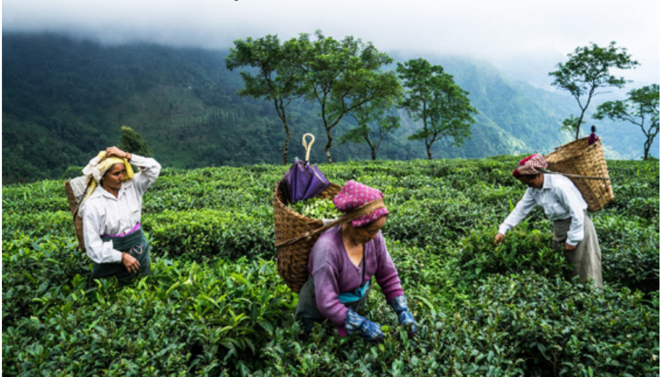
The Tea Gardens, Darjeeling

Darjeeling - the land of tea gardens! The Darjeeling district of West Bengal is known for its plethora of tea gardens, with over 80 stretching across acres of land. Located in the foothills of the mountains, the emerald-green Darjeeling Tea Garden produces tea with such an intense aroma and spicy flavour, that it's often referred to as the 'champagne of teas.'