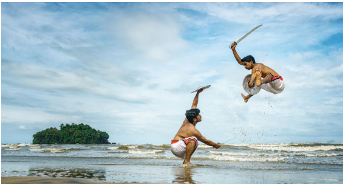
Kalaripayattu - Mother Of All Martial Arts

MARMASHASTRAM: This is the science of vital points. Knowledge of these points allows a Kalaripayattupractitioner