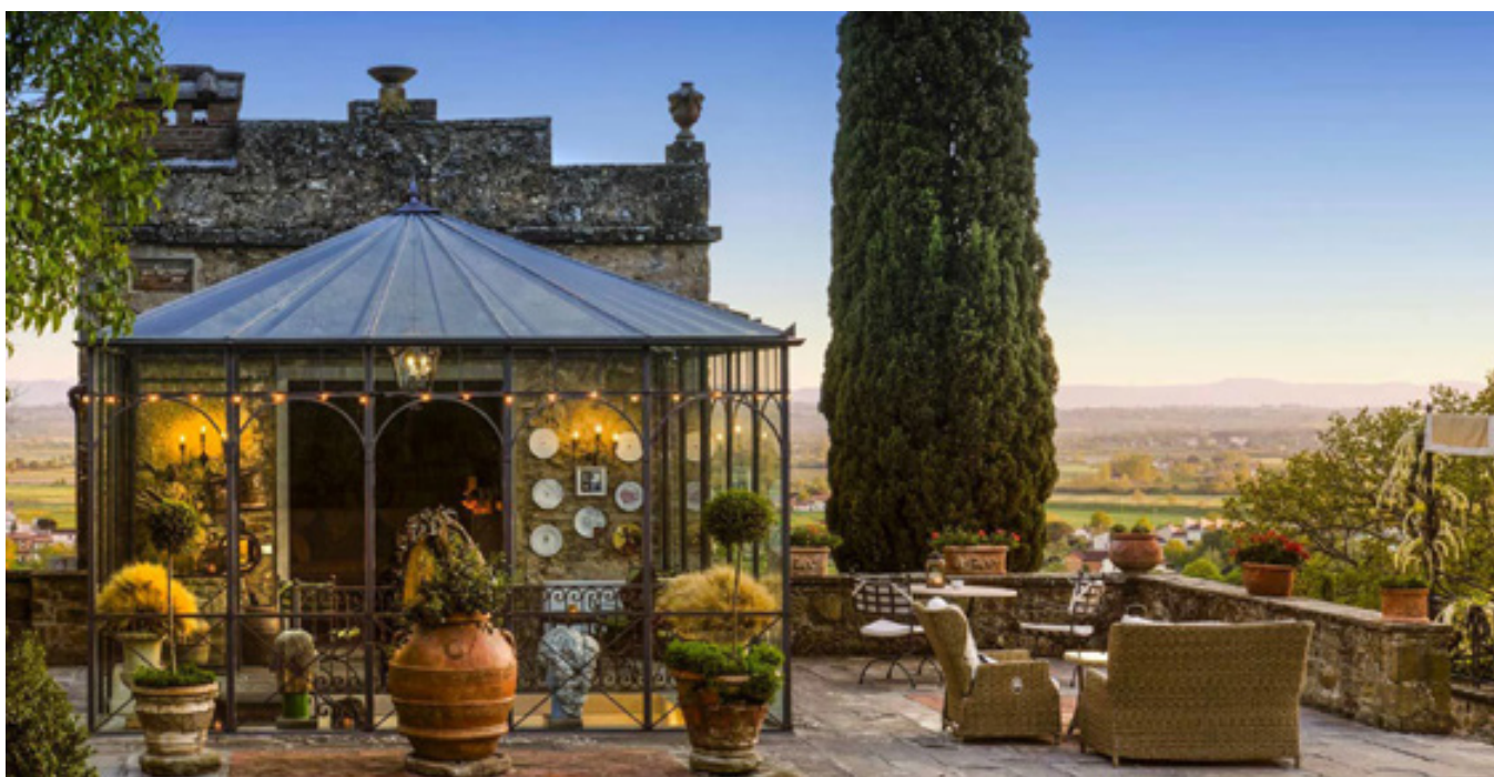
Relais Il Falconiere in Tuscany, Italy

wellness treatment here is an experience with professional therapists who have been carefully selected for their skills.