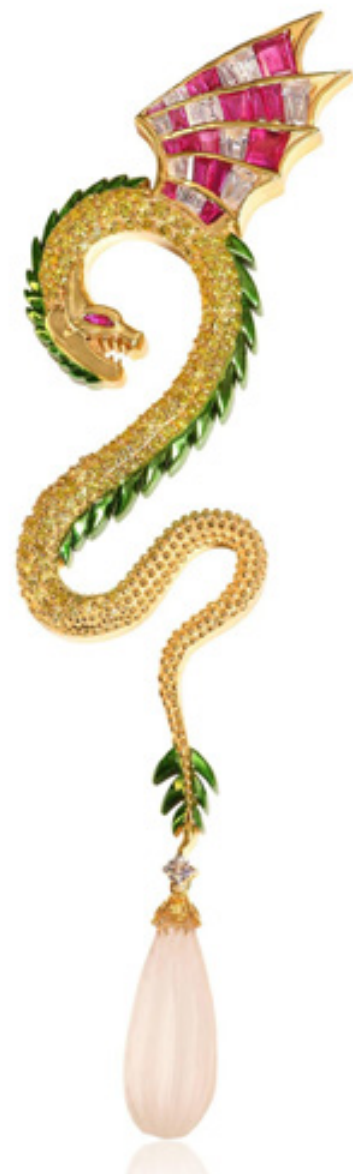
ENVY - Cocktail Brooch

Emerging triumphant as an extraordinarily rare piece, it is crafted in 18k Gold, Burmese Rubies & flawless diamonds